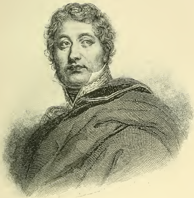
SOULT. DUC DE DALMATIE